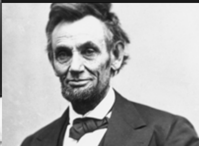
Clockwise from top left: Mother Teresa, Dr. Martin Luther King Jr., U.S. president Abraham Lincoln, Bishop Desmond Tutu, William Wilberforce.

world is bedeviled with conflicts on these general principles. For example, prominent voices are now challenging the whole idea of unique protections for religion. One such book bears the title Freedom from Religion and another, Why Tolerate Religion? 5