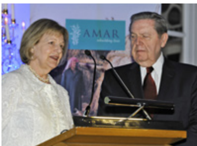
AMAR chair Baroness Emma Nicholson with Elder Jeffrey R. Holland in London, England.

For the full text and video of this address, go to mormonnewsroom.org .