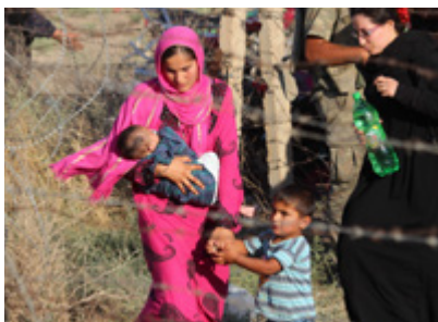
Refugees cross the border from Syria into Turkey.

What can religion and religious organizations contribute to help refugees and the countries that have received them—short term and long term? We know that some professionals are skeptical of the role of religious organizations in these matters, some even seeing religion as a disruptive influence. I will try not to contradict opinions based on facts with which I am not familiar. I will only share the policies and experience of The Church of Jesus Christ of Latter-day Saints, which I believe will illustrate the positive