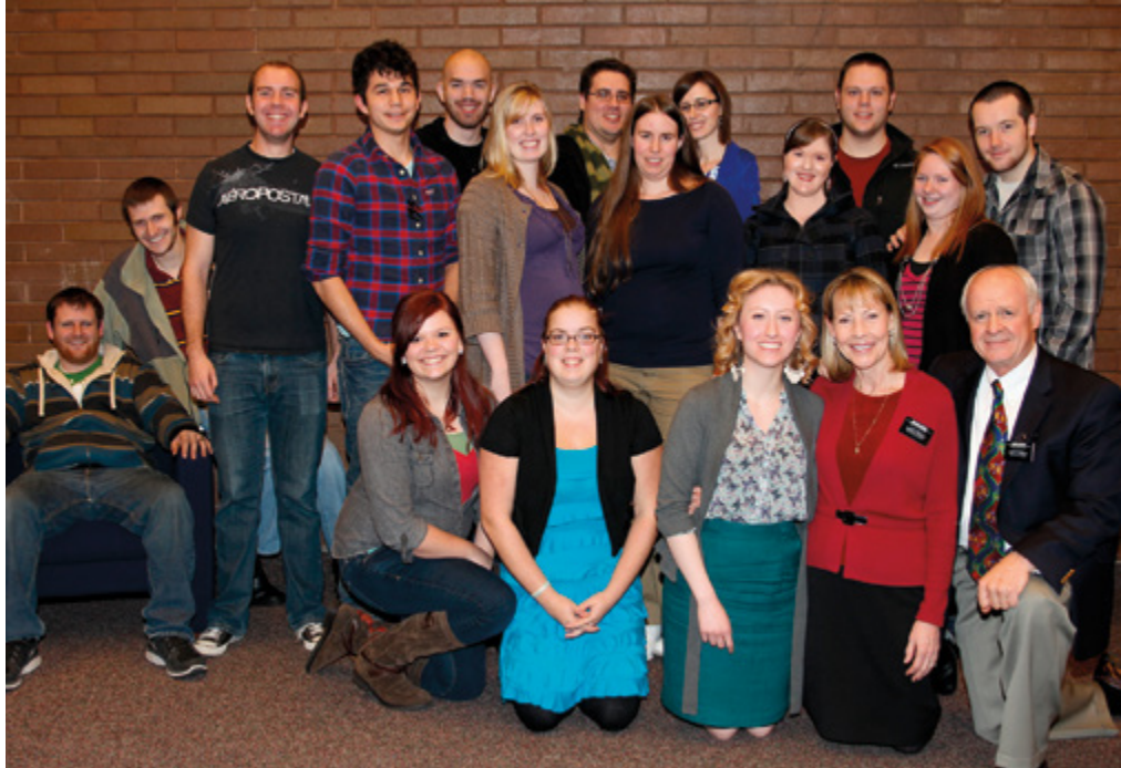
The author (second from left) with his Pathway class.

President Russell M. Nelson, President of the Quorum of the Twelve Apostles, "Will You Choose to Increase in Learning?" New Era , Sept. 2014, 3.