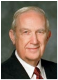
By Elder Richard G. Scott Of the Quorum of the Twelve Apostles