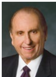
By President Thomas S. Monson