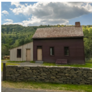
Joseph and Emma Smith’s home in Harmony, Pennsylvania.