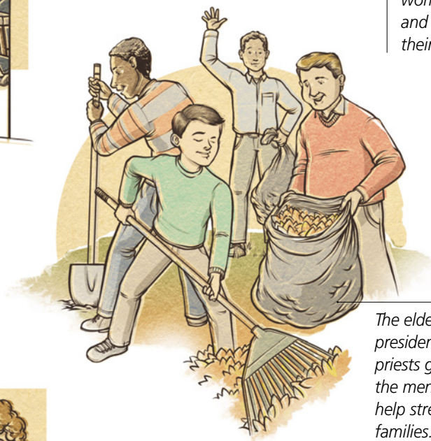
The elders quorum presidency and the high priests group leaders serve the men in the ward and help strengthen their families.