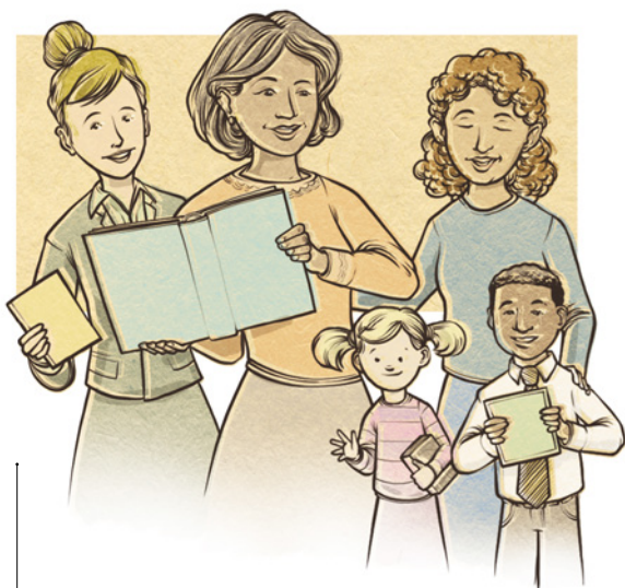
The Primary presidency serves the children, and the Young Men and Young Women presidencies serve the youth ages 12–18.