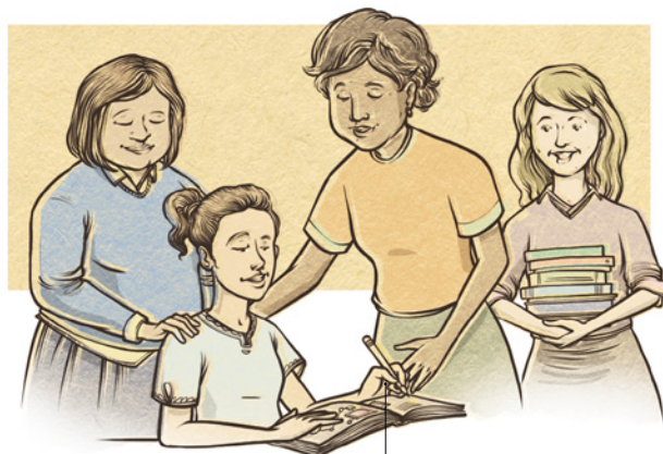
The Relief Society presidency serves the women in the ward and helps strengthen their families.