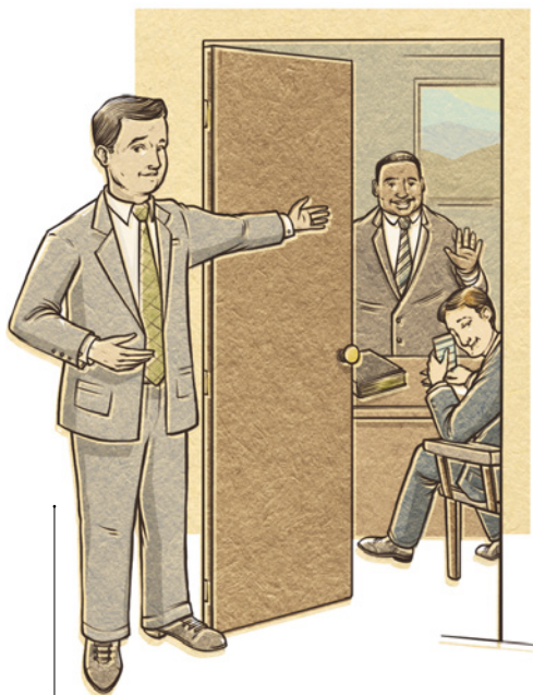
The bishop and his two counselors form the bishopric and preside over the ward.