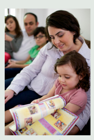
3. The sanctity of the home.