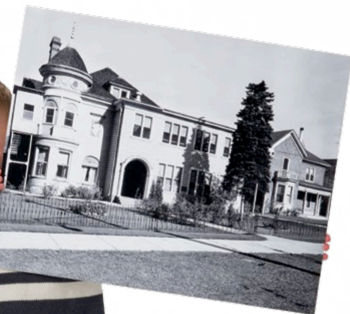
Top right: The Hyde home as it looked when it was converted to the first Primary Children’s Hospital.