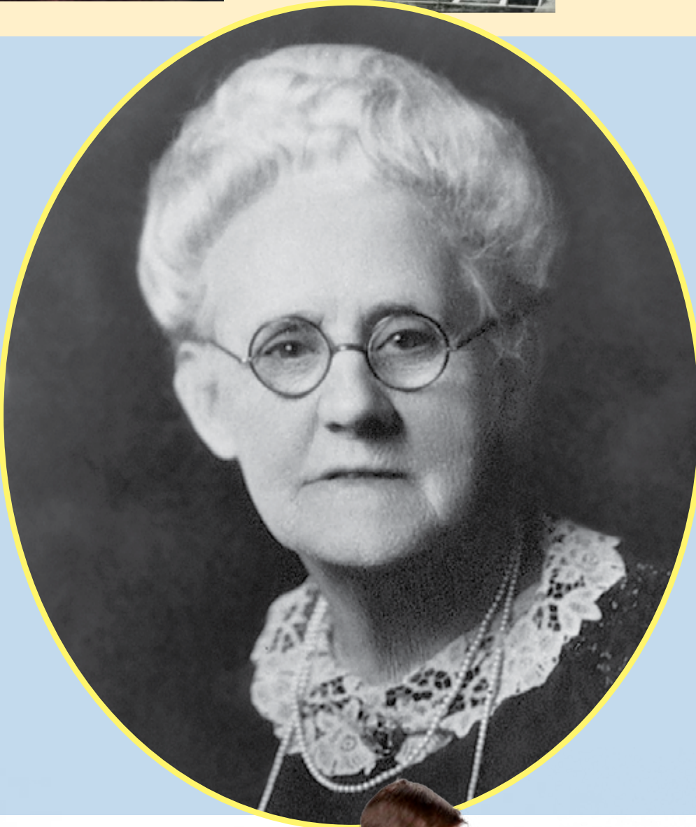
During her 45 years of service as Primary general president, Louie B. Felt “mothered” 100,000 children and guided 30,000 Primary leaders.