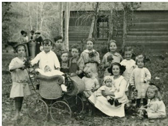
Spanish Fork Primary, circa 1917