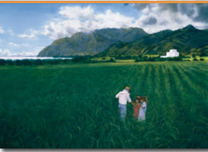
LEFT: PHOTOGRAPH OF 1882 MEETINGHOUSE; ABOVE: THE PROMISE, BY AL ROUNDS; BELOW LEFT: BUILDING NOW FOR ETERNITY, BY SYLVIA HUEGE DE SERVILLE, FOURTH INTERNATIONAL ART COMPETITION; BELOW: LEHI'S DREAM, BY ARACELI ANDRADE, SEVENTH INTERNATIONAL ART COMPETITION

He and all latterday prophets since the Restoration of the gospel know that these words written by the Prophet Joseph Smith in March 1842 are true: "The Standard of Truth has been erected; no unhallowed hand can stop the work from progressing; persecutions may rage, mobs may combine, armies may assemble, calumny may defame, but the truth of God will go forth boldly, nobly, and independent, till it has penetrated every continent, visited every clime, swept every