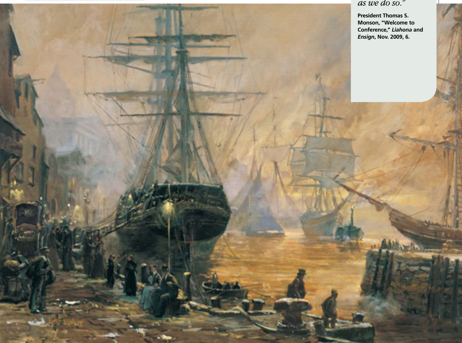
The ship Ellen Maria prepares to sail from Liverpool, England, for America on February 1, 1851. At the time, over 50,000 Latter-day Saints lived in the

"I would ask that your faith and prayers continue to be offered in behalf of those areas where our influence is limited and where we are not allowed to share the gospel freely at this time. Miracles can occur as we do so."