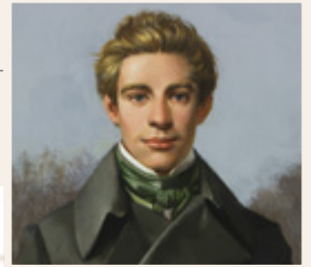
The Miraculous Mission of the Prophet Joseph Smith President Dallin H. Oaks