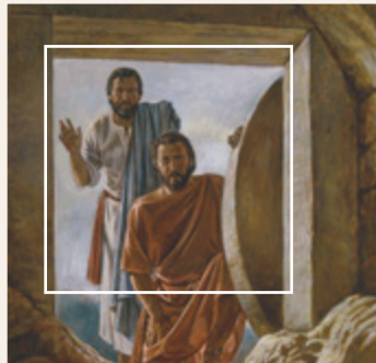
John: The Disciple Whom Jesus Loved