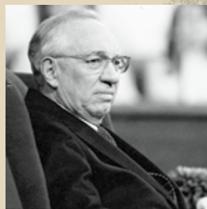
Clockwise from top: President Hinckley meeting with members; with his wife, Marjorie, in Hong Kong, China; contemplating at general conference.

After their five children were grown, the Hinckleys usually traveled together, and Sister Hinckley reached out with love around the world. When she met missionaries, she would often give their parents a surprise phone call when she returned home. She was also gifted at connecting with large audiences. “[Marge] knows how to say the things that please and help the people,” President Hinckley recorded after a regional conference. “The rest of us preach while she simply talks with them.” 16