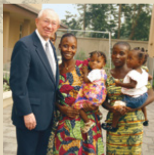
Clockwise from top: President Hinckley at the Boston Massachusetts Temple; interacting with the news media; with members in Ghana.