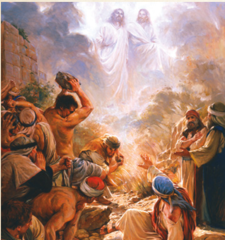
While being stoned to death, Stephen saw the Father and the Son.

D&C 29:10–12 Jesus Christ has promised to return to earth with power and glory.