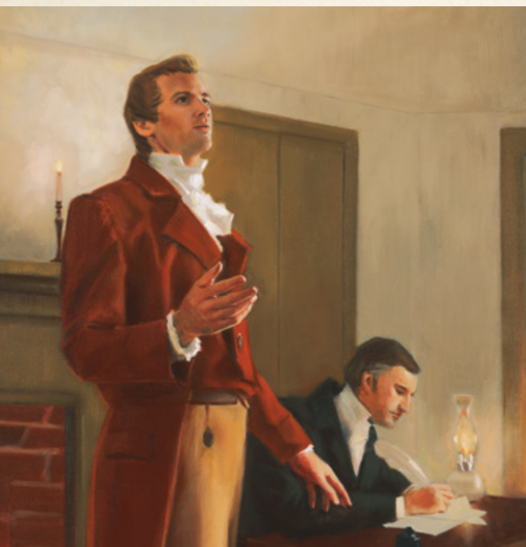
Joseph Smith received many revelations from the Savior.

D&C 18:33–35 “I, Jesus Christ, your Lord and your God, have spoken it. These words are not of men . . . , but of me; . . . it is my voice which speaketh them unto you.”