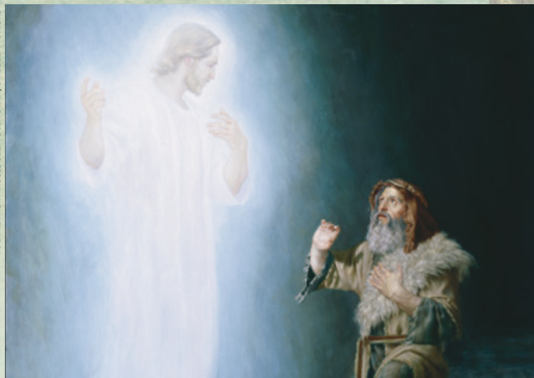
Jehovah (Jesus Christ) spoke to Moses face to face.