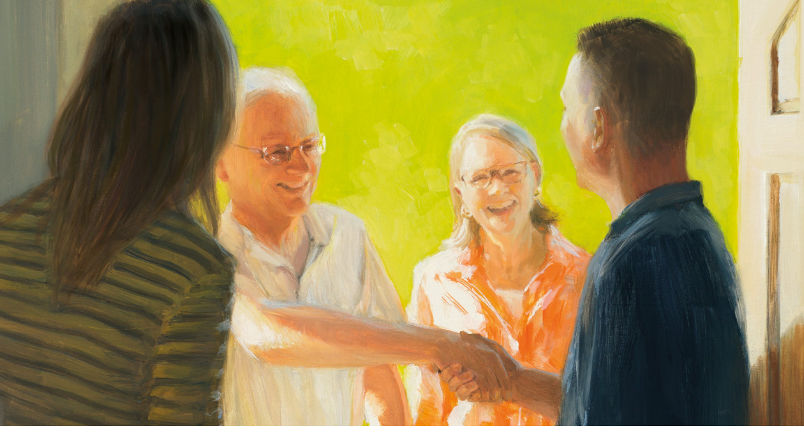
I saw in front of me the ward mission leader with whom I had worked for a large part of my mission.

two and a half days before I was placed for adoption, I felt such relief and comfort. We talked for almost an hour, and I began to sense the fulfillment of a need I hadn't even known I had. I also felt deeply grateful to my birth mother for her gift in giving me to the family I grew up with.