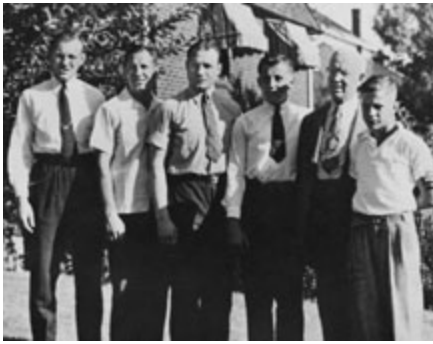
Above: President Smith with his sons. Above right: Elder Smith is greeted by President David O. McKay, 1961. Right: President Smith seated on the stand in the Salt Lake Tabernacle. Below: President Smith poses for a photograph at a baseball game, a sport he enjoyed playing as a youth.