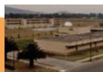
1964: Benemérito School opens in Mexico City.