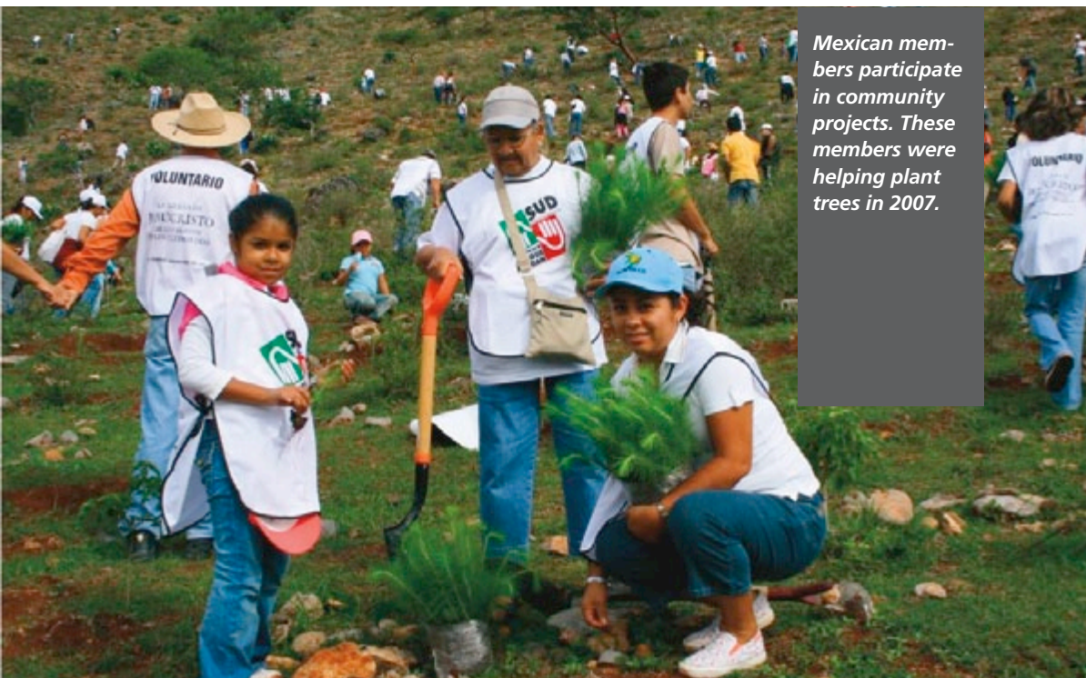
Mexican members participate in community projects. These members were helping plant trees in 2007.