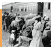
1912: Exodus from Mormon colonies, in northern Mexico.