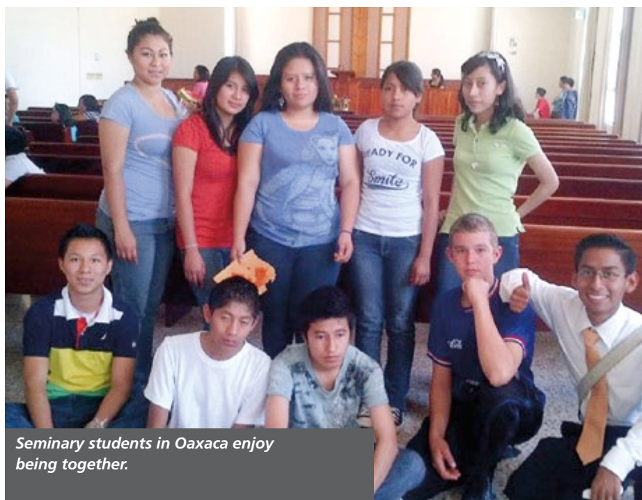
Seminary students in Oaxaca enjoy being together.