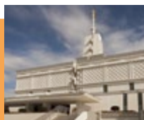
1983: Mexico City Temple dedicated.

1975: 12 new stakes organized in several areas of Mexico.