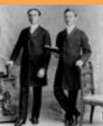
1921: Missionaries reassigned to Mexico City area.