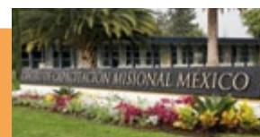
2013: Missionary training center opens in Mexico City.

2009: First all-Mexican Area Presidency called.