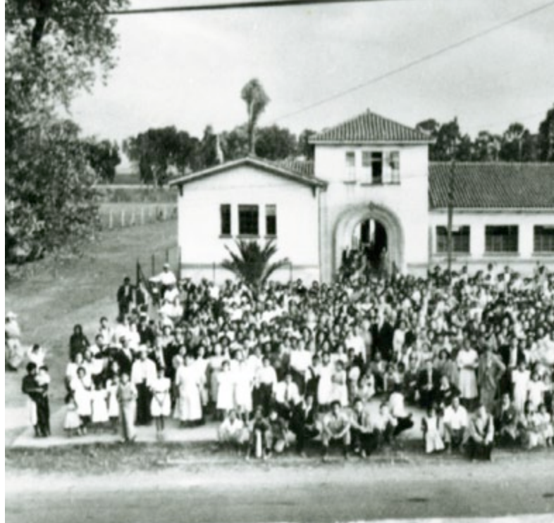
President George Albert Smith visited Mexico and helped unify the members as he reached out to the Third Convention.

While the Saints were establishing the Church in Utah, the Mexican people were working to restructure their society, including writing a new constitution that separated church and state. The gospel message came to Mexico in 1876 with the first missionaries, who carried selections