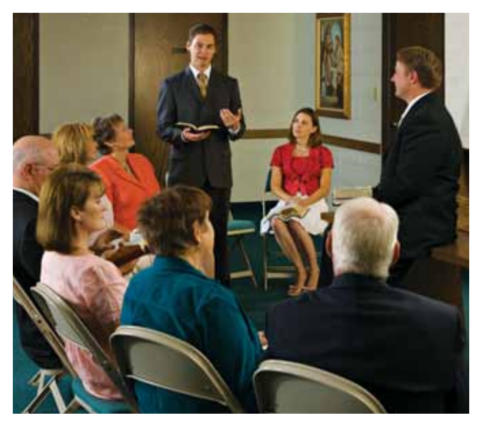
owerful gospel teaching and inspired learning occur when teachers and learners understand that the real teacher in any Church class is the Holy Ghost and that classroom participation invites the Spirit to bear witness.

"After Hurricane Mitch passed through Central America in 2001 and left everything in desolation, I had many questions," he says. "Seeking answers, I went to a friend I greatly respect. He said, 'Read the scriptures. You will find the best answers to your questions in them.'