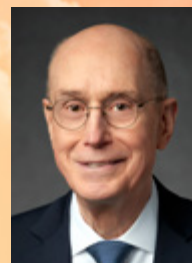
By President Henry B. Eyring Second Counselor in the First Presidency