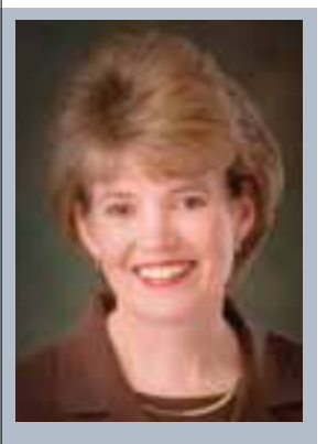
We are all engaged in the process of retaining new members. It is the ongoing process of conversion of turning and constantly returning to the Lord.