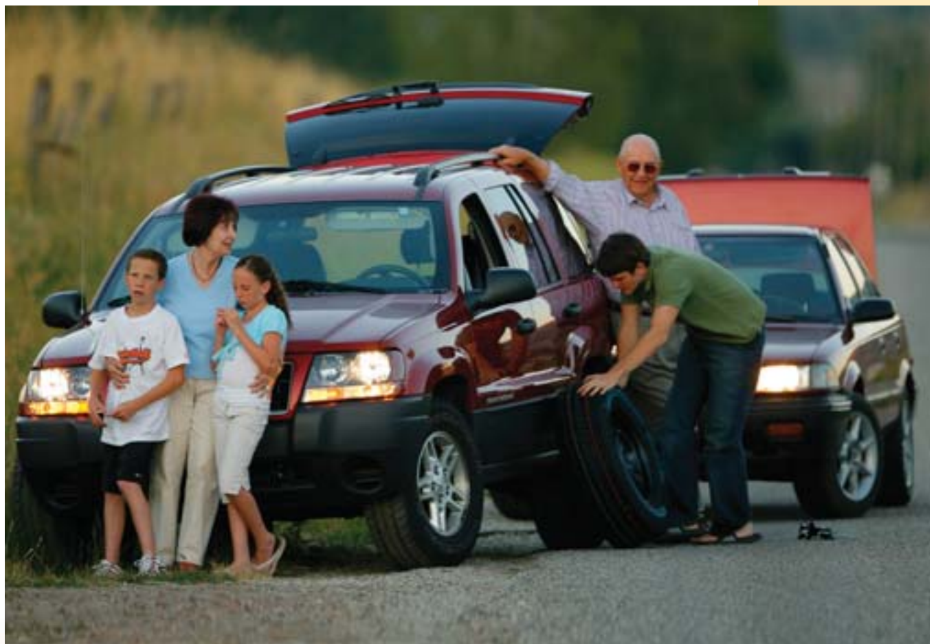
LEFT: PHOTOGRAPH BY MATTHEW REIER; RIGHT: PHOTOGRAPH BY ROBERT CASEY; PHOTOGRAPHS POSED BY MODELS

W e’re coming to be recognized as a good people, willing to reach out and help.