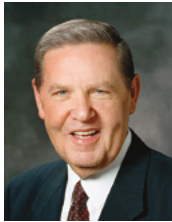
By Elder Jeffrey R. Holland Of the Quorum of the Twelve Apostles