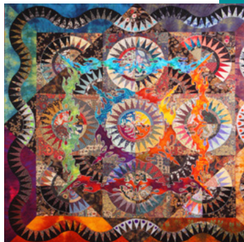
Kazuko Covington, Worlds without End (see Moses 2), Japan