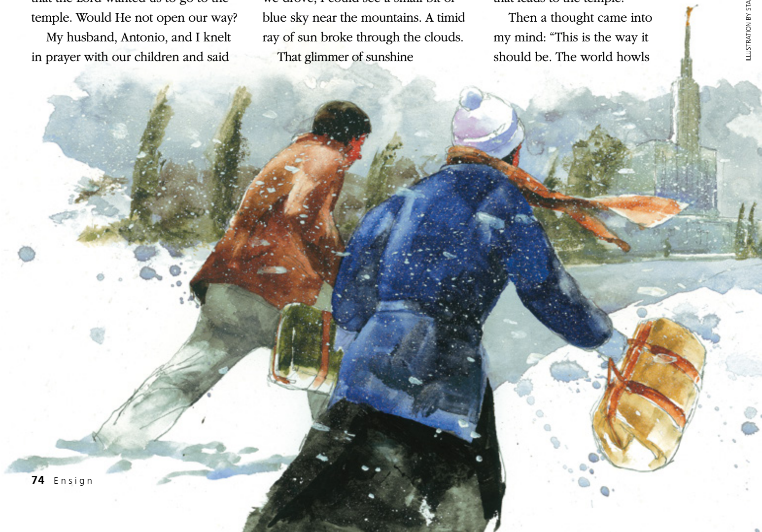
ILLUSTRATION BY STAN FELLOWS

Then a thought came into my mind: "This is the way it should be. The world howls