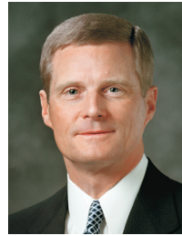
Elder David A. Bednar Of the Quorum of the Twelve Apostles

We are pleased to announce the month-long Christmas initiative, "He Is the Gift." Beginning November 28, He Is the Gift focuses on God's love for the world, made manifest in the first gift of Christmas, even the Lord Jesus Christ.