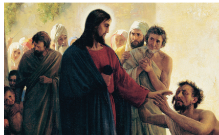
Embrace The Gift