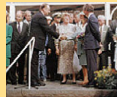
◀ 1995: King Carl XVI Gustaf and Queen Silvia hosted by President Thomas S. Monson on Stockholm Temple grounds