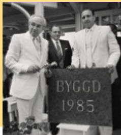
◀ 1985: Stockholm Temple dedicated by President Gordon B. Hinckley