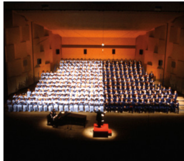
The Mormon Tabernacle Choir performed in the Stockholm Concert Hall in 1982.