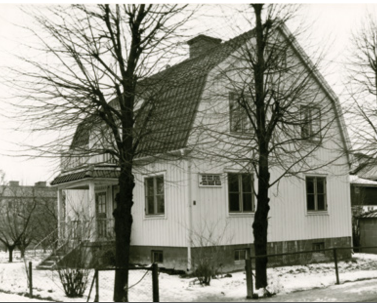
Members in Västerås met in this home in the 1950s.

would say to herself, “God should not have to wait.” She would sing a song, say a prayer, give a little talk, and then finish with another song and prayer.