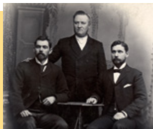
1914: Swedish parliament mem- bers vote against a proposal to expel "Mormon agents" from the country