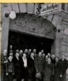
► 1905: Sweden Mission organized