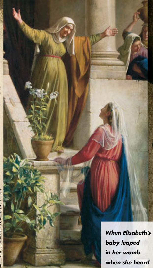
MARY'S VISIT TO ELIZABETH, BY CARL HENRICH BLOCH

Mary's visit to Elisabeth likewise contains powerful testimony, both of the identity of Mary's unborn babe and of her own mission and faithfulness. When Elisabeth hears Mary's greeting, the Holy Ghost causes her own baby to leap in her