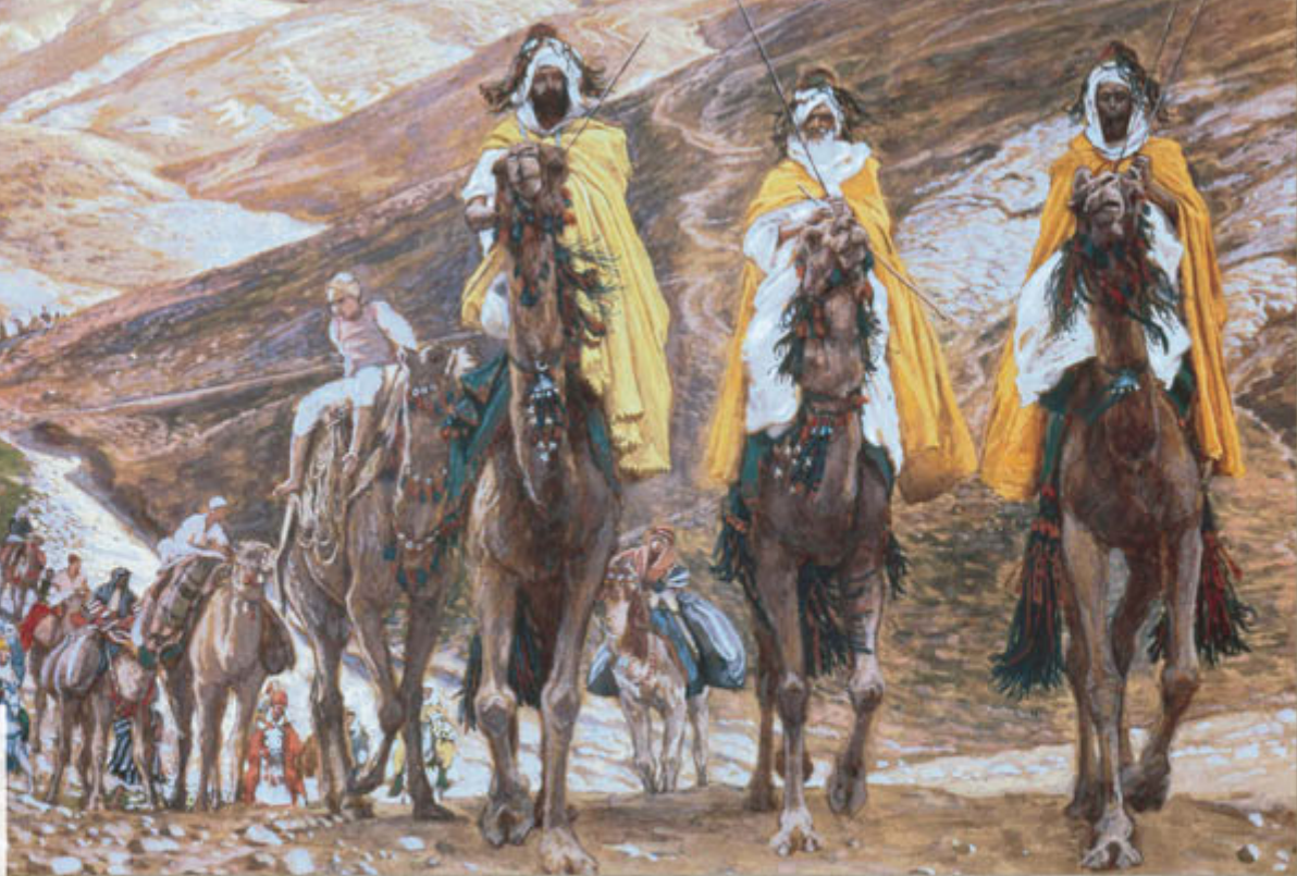
THE JOURNEY OF THE MAGI, BY JAMES TISSOT

Luke's story begins with the promise of a child to the elderly Zacharias and Elisabeth, a story that provides a contrast to the promised advent of Jesus. Both conceptions are miraculous: John is born to a barren mother past