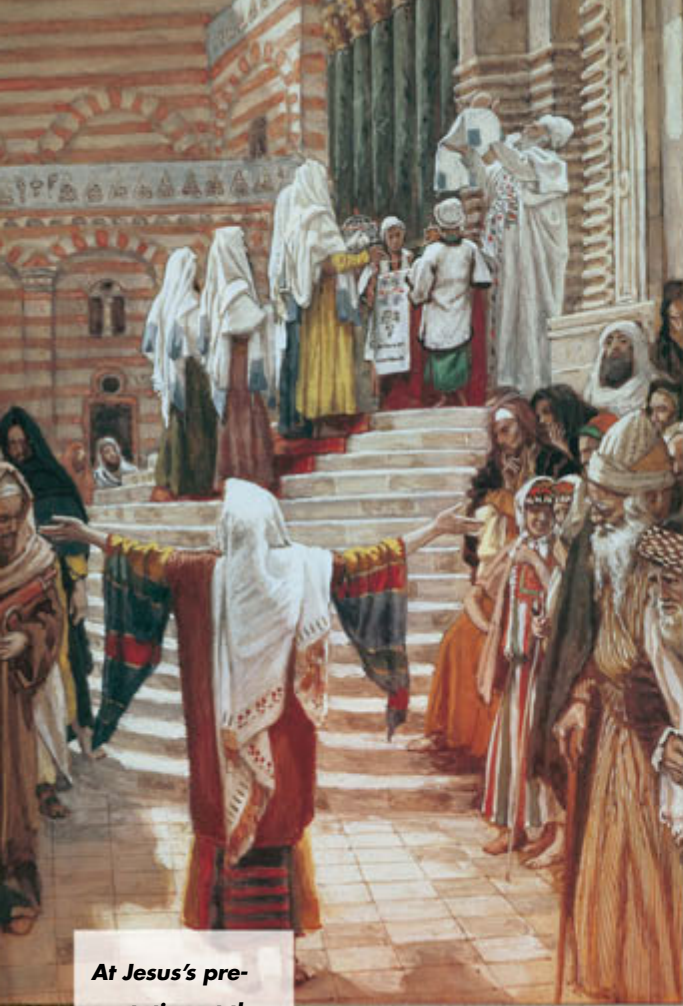
THE PRESENTATION OF CHRIST IN THE TEMPLE BY JAMES TISSOT

At Jesus's presentation at the temple, Simeon gave thanks for the light and salvation the Savior had brought to Israel and Gentiles alike. Anna the prophetess gave thanks for the redemption of Israel.