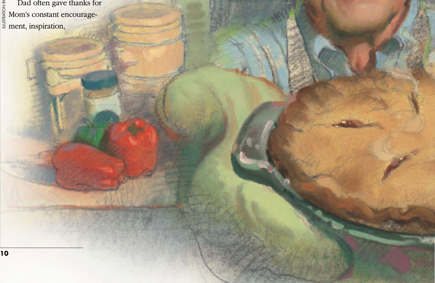
ILLUSTRATION BY GREGG THORKELOSON