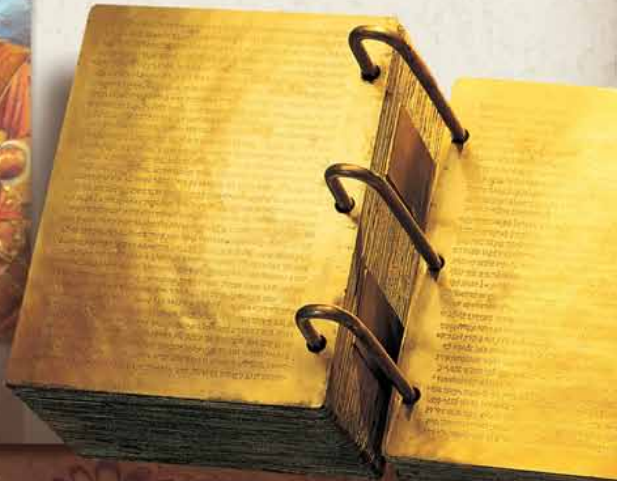
DETAIL FROM NEPHI WRITING ON THE GOLD PLATES; BY PAUL MANN; PHOTOGRAPH OF GOLD PLATES REPLICA; JOSEPH SMITH WRITING; BY DALE KILBOURN