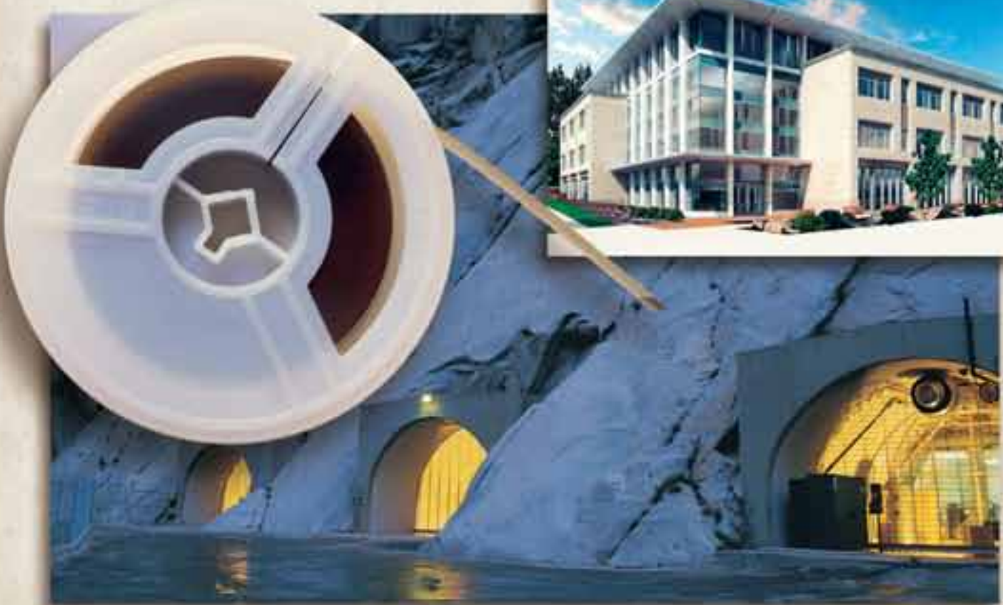
In the mountains south of Salt Lake City, the Granite Mountain Records Vault houses microfilm copies of much of our Church and family history. Inset: An architect's rendering of the new Church History Library, to be completed in the summer of 2009.

Finally, we need to remember that acquiring a heritage of Church history requires more than simply reading a history book. It includes visiting a historic site, visiting a