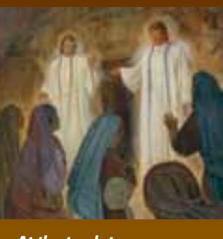
At the tomb two men in "shining garments" declared that Jesus had risen from the dead.