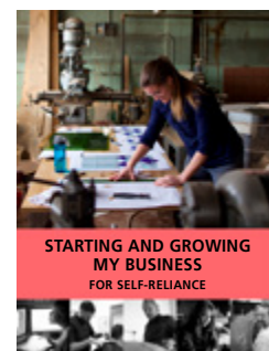
These manuals represent four of the Church’s self-reliance courses. For more information, ask your bishop or visit srs.ChurchofJesusChrist.org .