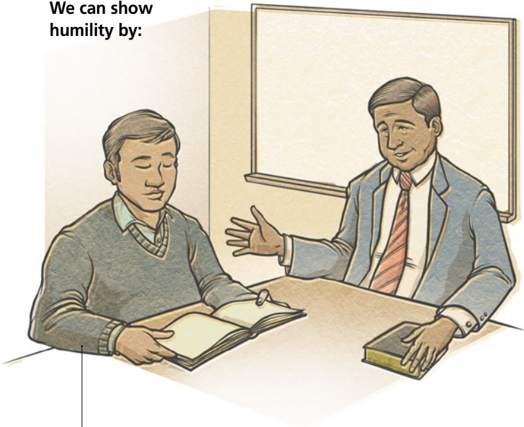
Receiving counsel and correction.