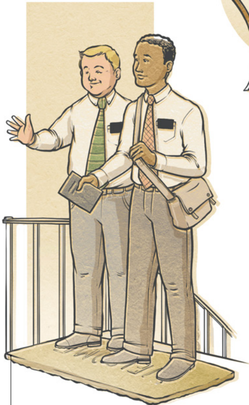
Serving a mission.