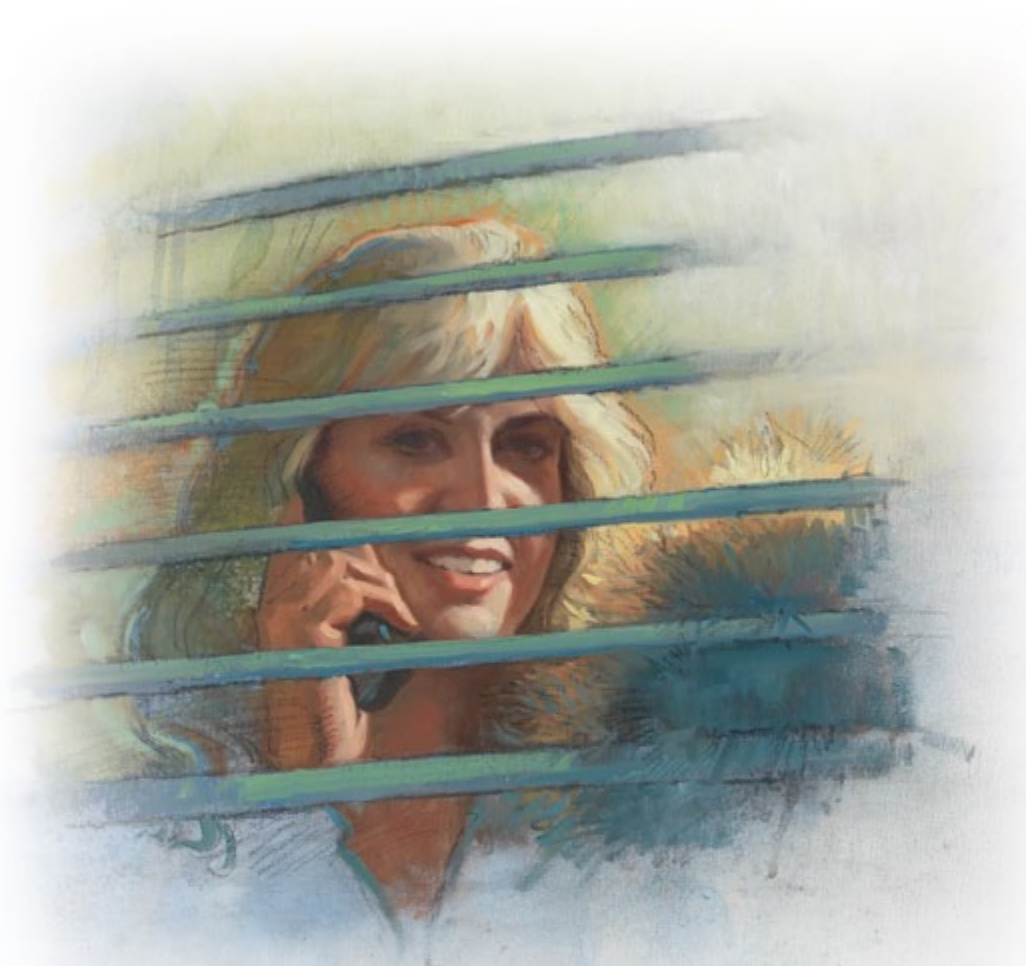
I picked up the phone and dialed the number of an old friend I hadn't talked to in years, planning to tell her about my daughter's wedding.

My mind wandered again, and I tried to remember when my blinds had last been cleaned so thoroughly. I thought of the two girls who had come to help me get ready for a gathering at my house two years earlier. Together they had scrubbed my kitchen from floor to ceiling, including the blinds. That memory