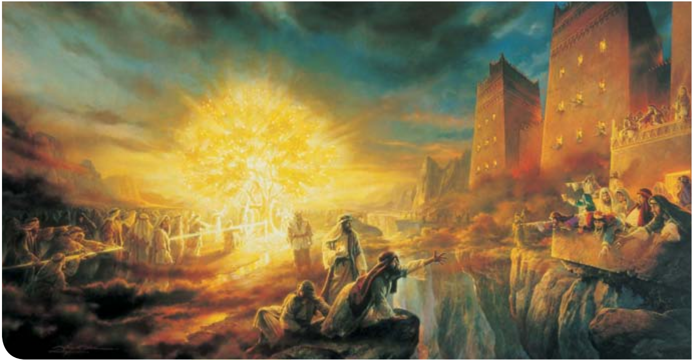
LEHI'S DREAM, BY GREG OLSEN. MAY NOT BE COPIED. PHOTO ILLUSTRATION BY JOHN LUKE