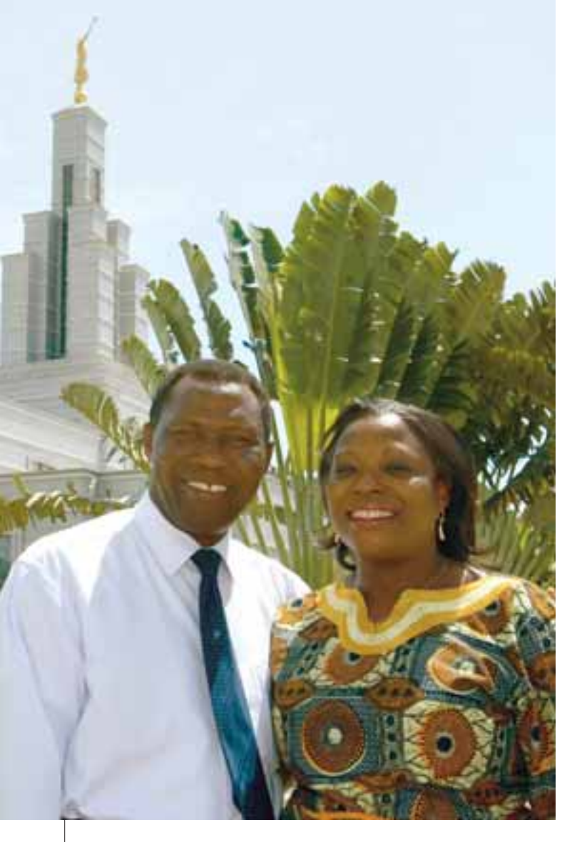
How we dress portrays whether we have proper respect for temple ordinances and eternal covenants and whether we are preparing ourselves to receive them.

wear casual clothes of any kind to the temple? If you are coming to the Lord's house, shouldn't you be wearing your Sunday best?