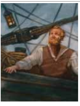
If we lift one weary hand which hangs down, if we bring peace to one struggling soul, if we give as did the Master, we can—by showing the way—become a guiding star for some lost mariner.

As we remember that "when ye are in the service of your