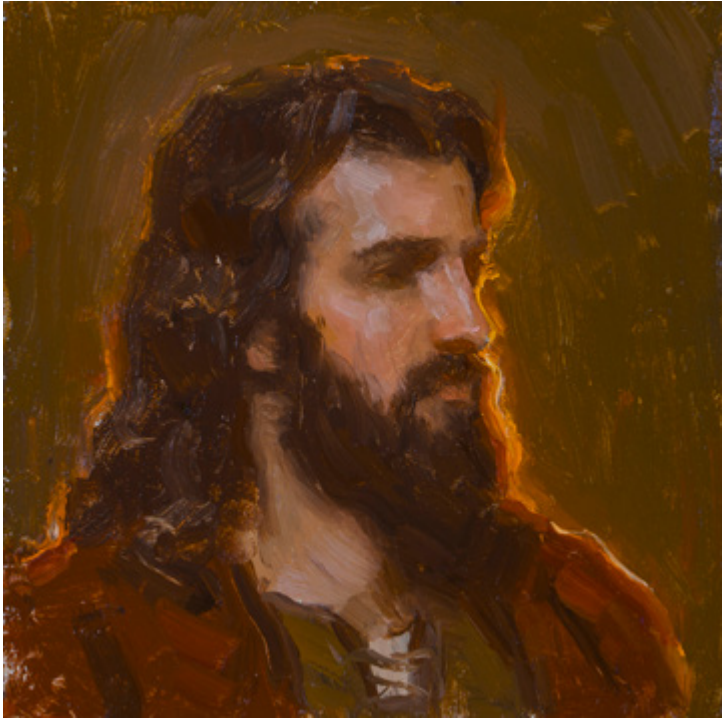
HIS LIGHT, MAY NOT BE COPIED