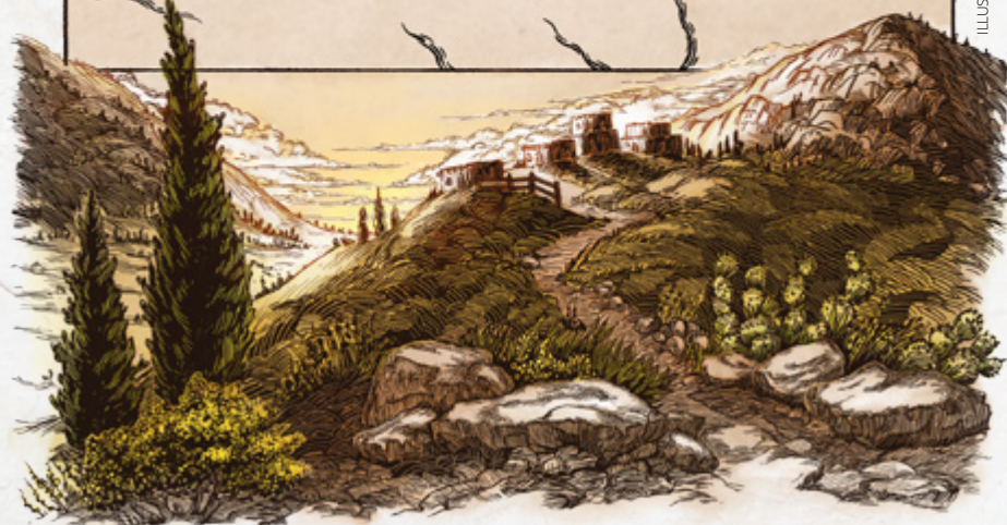
ILLUSTRATION BY KEITH BEAVERS