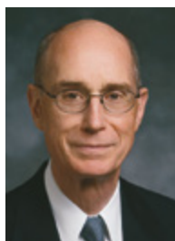
By President Henry B. Eyring