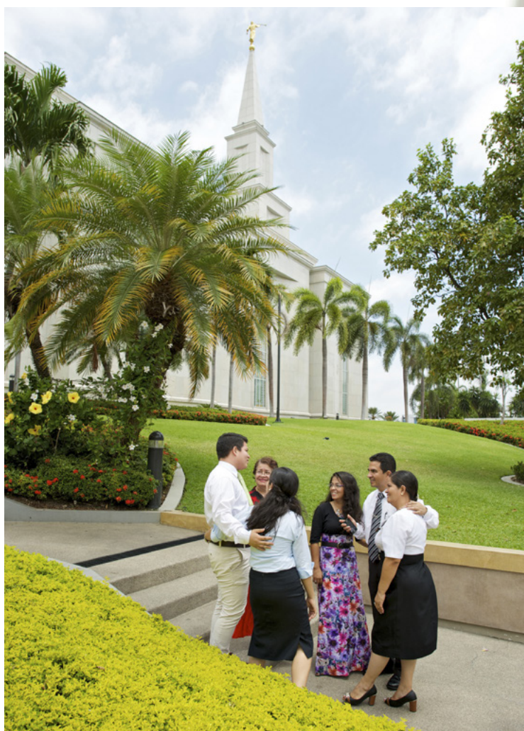
GUAYAQUIL ECUADOR TEMPLE

"The eternally significant blessing of uniting our own families is almost beyond comprehension."