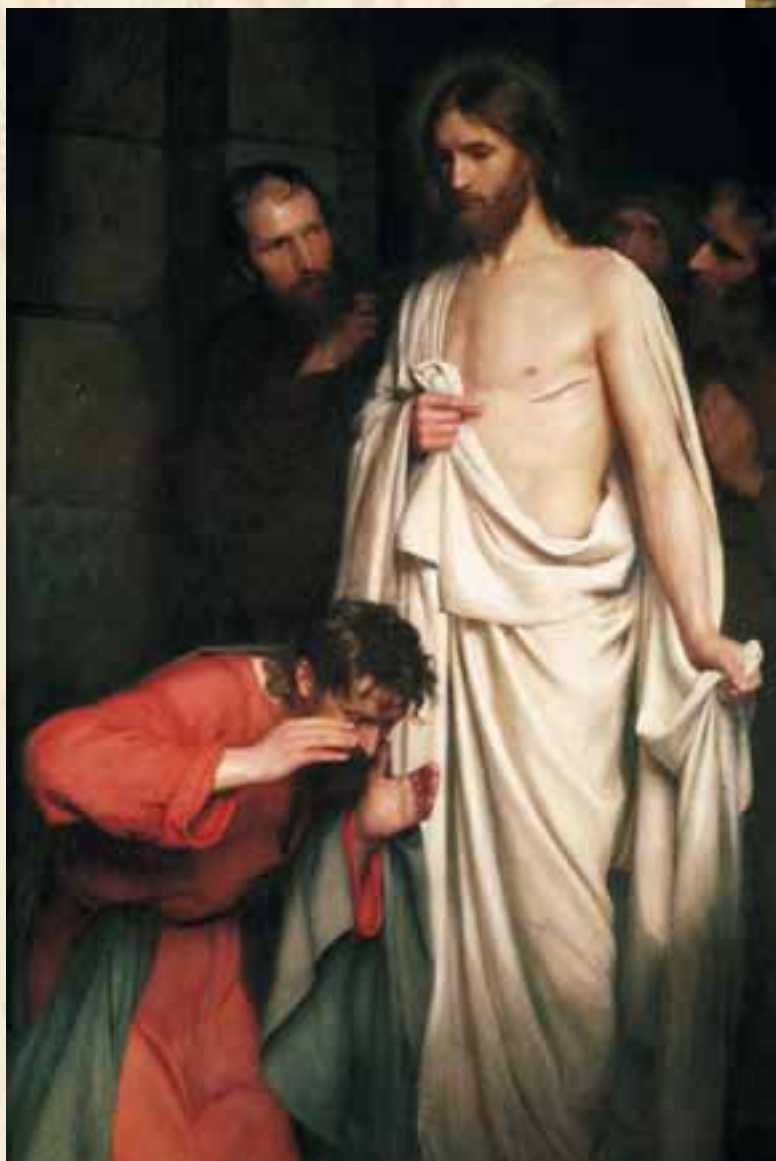
Above: The Doubtful Thomas, by Carl Heinrich Bloch

Christ said to Thomas, "Reach hither thy finger, and behold my hands; . . . and be not faithless, but believing" (John 20:27).