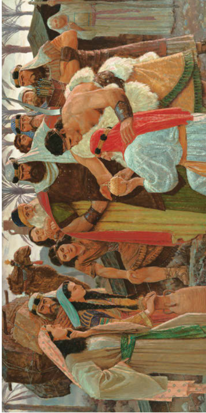
ULehi uthola iLiyahona Ukupendwa ngu-Arnold Friberg Bheka u 1 Nefi 16, ikhasi 43-47