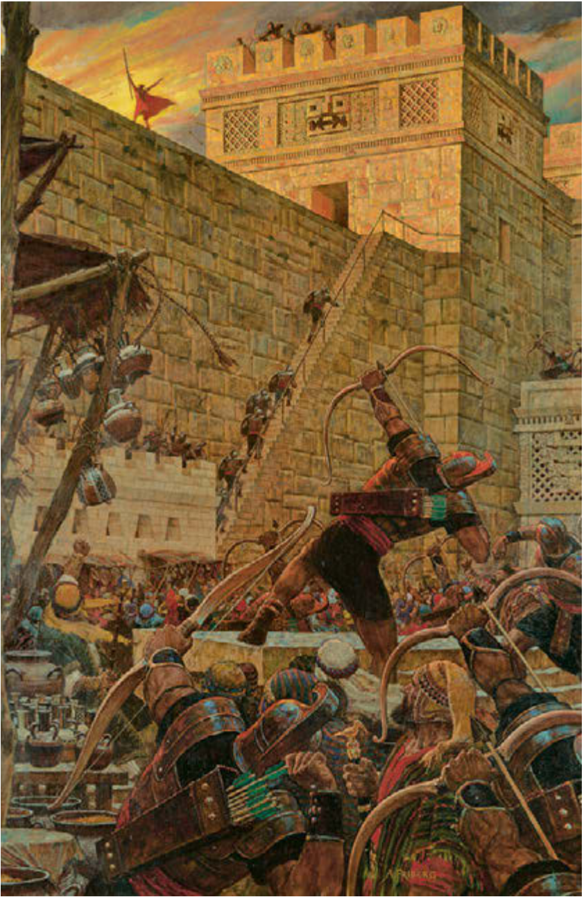
USamuweli umLamani uyaphrofetha Ukupendwa ngu-Arnold Friberg Bheka uHelamani 16, ikhasi 547–550