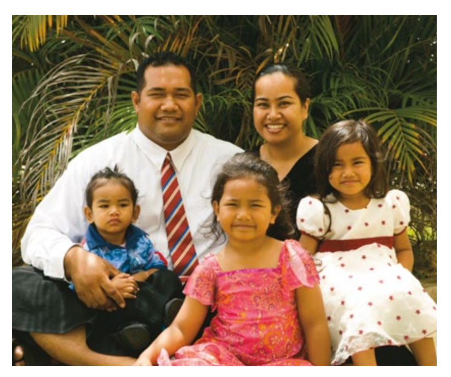
"The thing . . . that is worth more than all the rest is the opportunity to obtain eternal life [with your] sons and daughters, husbands and wives."

The treasures that we will find when we go to the other side will be those that we have laid up there by ministering to our Father's other sons and daughters with whom we have associated here. He has made this possible for all of us, and during our stay here we will be happier serving our fellows than we could possibly be in any other way. <sup>16</sup>