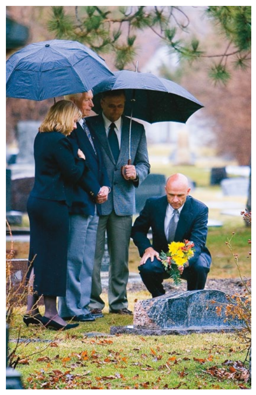
"I am thankful that there has been revealed to us and made plain in this latter-day that this life is not the end, that this is but a part of eternity."