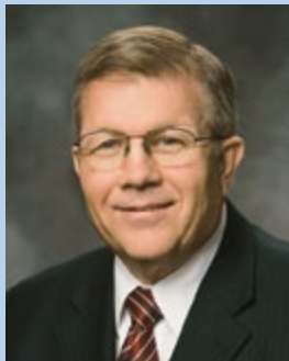
By Elder Allan F. Packer Of the Seventy

You never know when you'll need greater spiritual power, so do what it takes to make sure your spiritual batteries are fully charged.