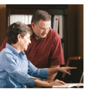
6. We then prepare the names of our ancestors for temple work and perform necessary ordinances for them in the temple (see 1 Corinthians 15:29; D&C 128:15–16, 24).