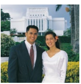
4. Husbands and wives are sealed (married) in the temple for time and all eternity.