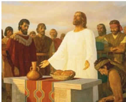
Jesus Christ's appearance