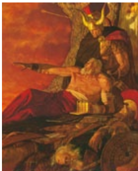
Mormon's and Moroni's closing appeals