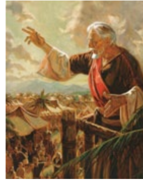
King Benjamin's sermon