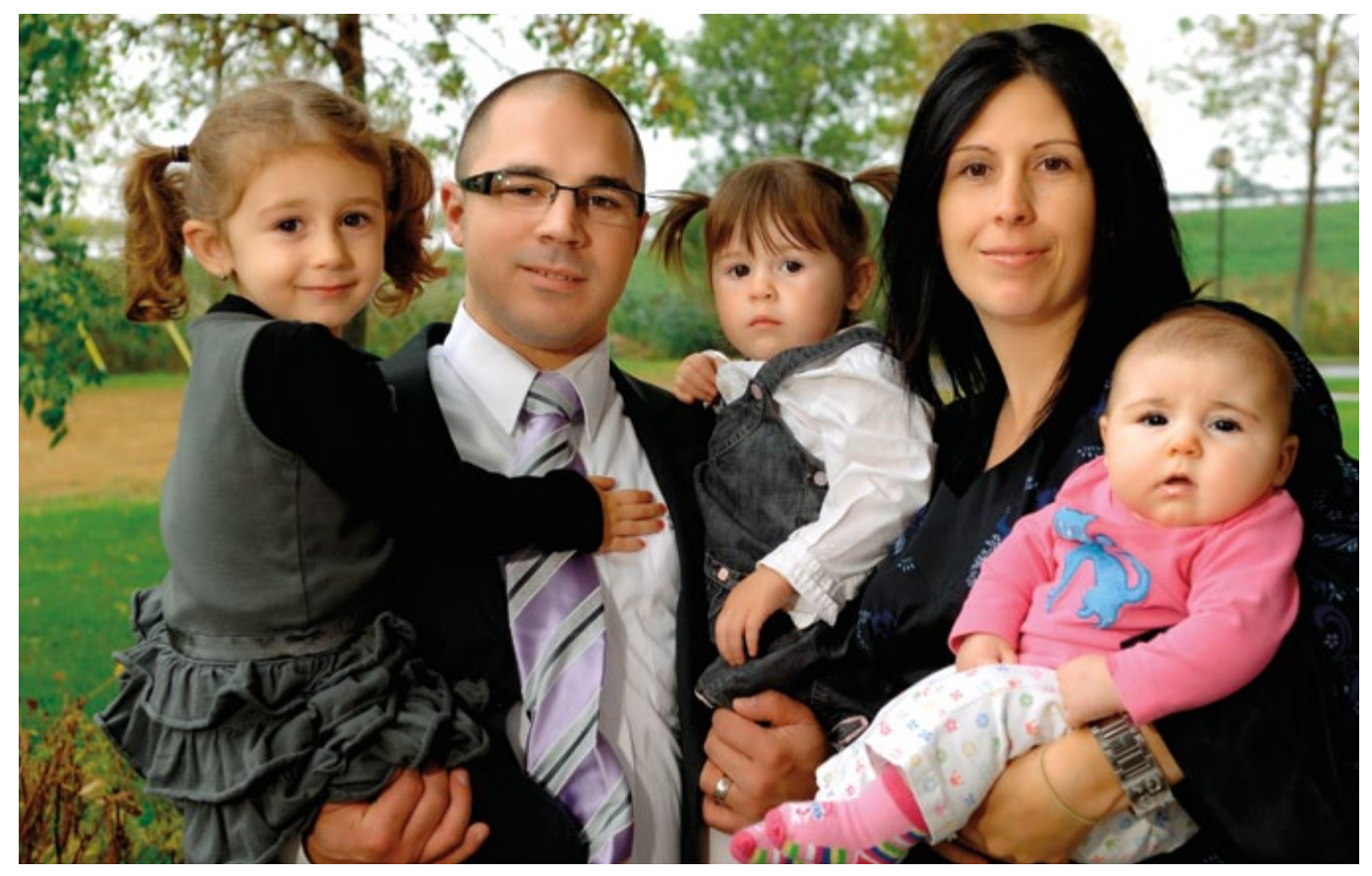
Montreal, Quebec, Canada

grow and progress. You also knew that you could continue making correct choices, repent of incorrect choices, and through the Atonement of Jesus Christ inherit eternal life.