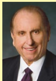
By President Thomas S. Monson