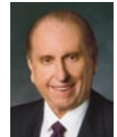
President Thomas S. Monson Go up