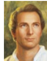
Joseph Smith Go up