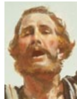
John the Baptist Go right