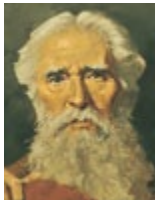
Moses Go down