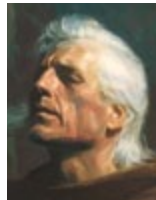
Moroni Go left