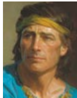
Mormon Go left