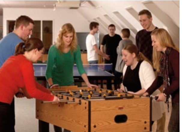
Young adults have opportunities to serve on a center activities council, work with full-time missionaries to help teach and activate their peers, and associate with a senior couple.