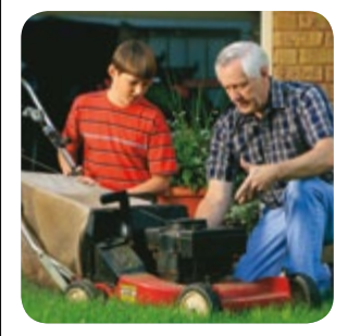
2. We feel the joy of God's plan for us on earth.