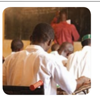
1. We strengthen our character and develop work skills.

Blessings come to us as a result of work.