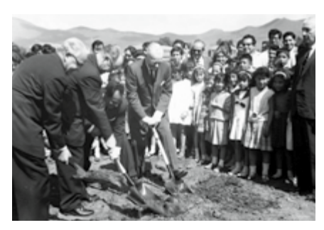
Church leaders participate in the groundbreaking for Benemérito de las Américas on November 4, 1963.

In 2004, Mexico became the first country outside the United States to have one million members.